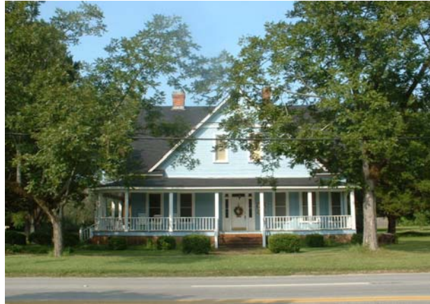
Urban area in Mississippi

The archaeological survey of the cellular tower footprint areas did not lead to the locating of any cultural resources, therefore the construction activities proceeded without hindrance.